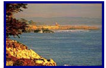
West Cliff Drive, Santa Cruz

The AOC recognized early in the deployment effort that there was a need for additional testing and upgrades to the system to ensure a smooth implementation and worked with ISD and the Court to develop a plan to execute more comprehensive application testing. This process took roughly one and one half months to complete, but the end result was a smooth installation and a robust testing process that will be required in all