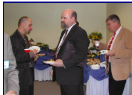
ISD Open House

The tour group was given a demonstration of Imaging on the Web, also known as IOTW. Imaging on the Web provides access to ICMS via an Internet interface allowing access to court documents that have been imaged. Many Judicial Officers are using IOTW to access court records and documents on the bench instead of using case files.