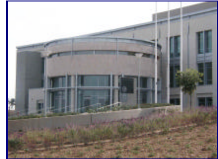
Southwest Justice Center Murrieta, California