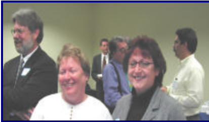
ISD Open House

On Friday, February 21, 2003, ISD Corporation hosted an open house at its new Corona Headquarters Office.