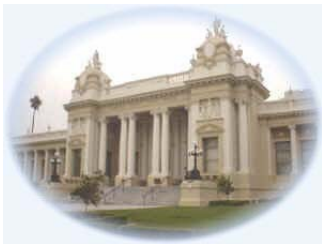
Superior Court of California County of Riverside

ISD Corporation's service, ePay-it.com, is launched at another court in California